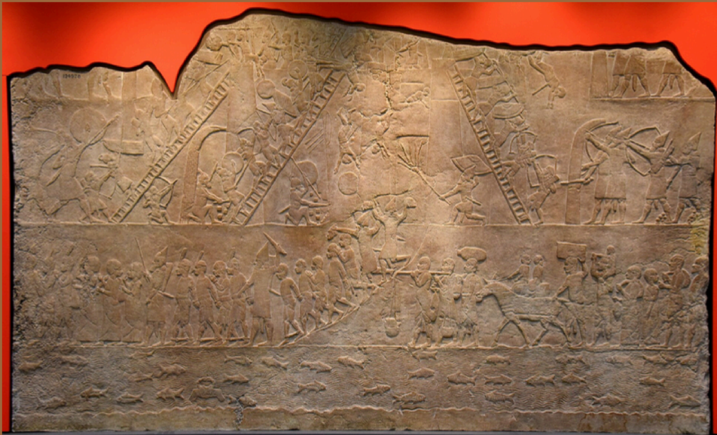
The Sacking of Thebes (667-663 BC)