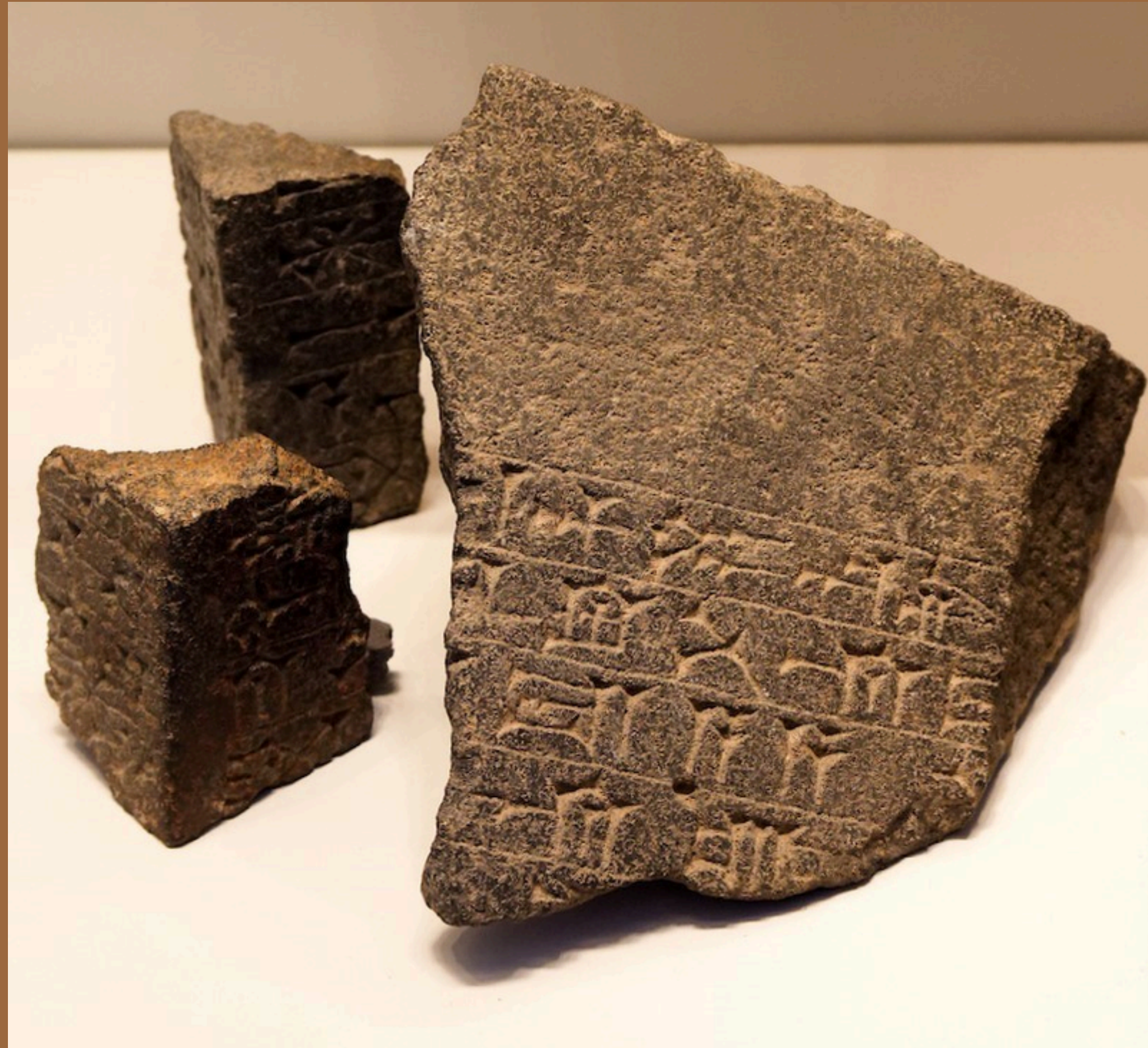
The Ashdod Stele of Sargon II